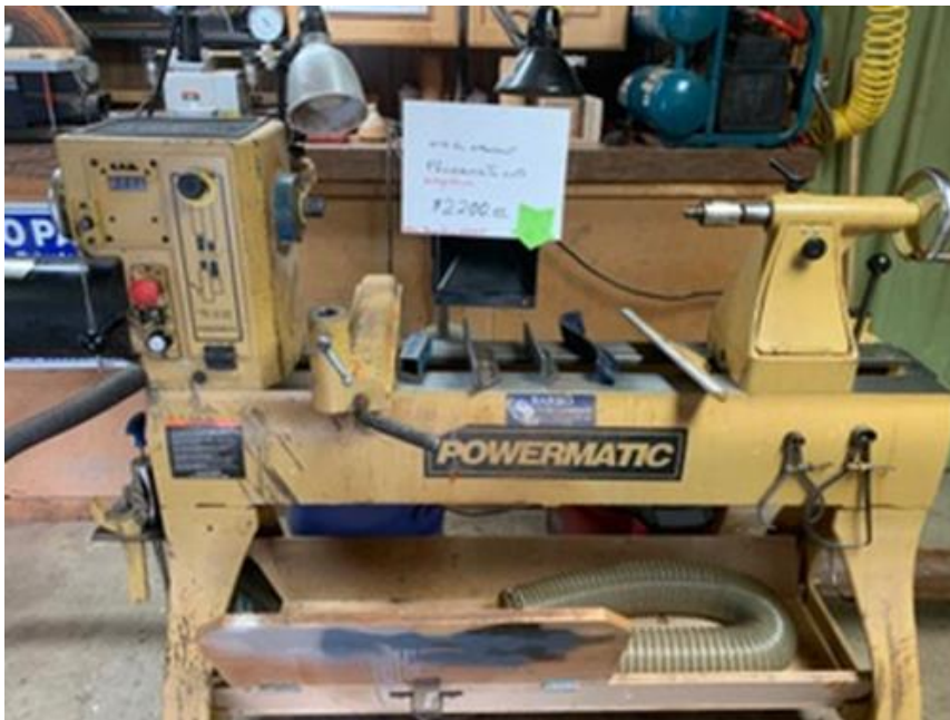
The lathe a Powermatic 3520B with and attached vacuum for $2200.00

Well, where do I start? I am hoping this finds you all well with all that we have been undergoing. What a time, Huh? Well, I have hung up my gouges and must call it quits, just can't do it anymore. Therefore I am putting up for sale, and at good prices, my collection of turning tools and machinery. I wish to offer them for sale to any of the members of the Turning Club I am very fond of, " Cascade Woodturners".