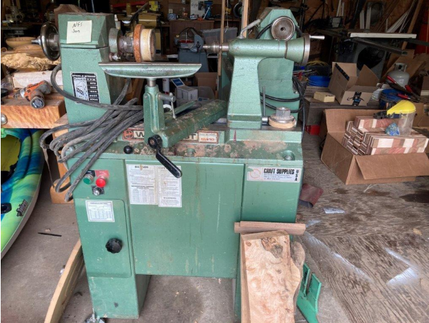
Woodfast lathe model m910 $2000