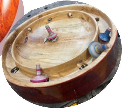
DARCY TATARYN, OCTOBER