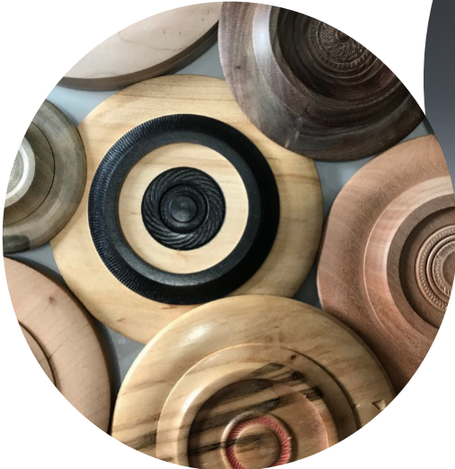
TOD RAINES, APRIL