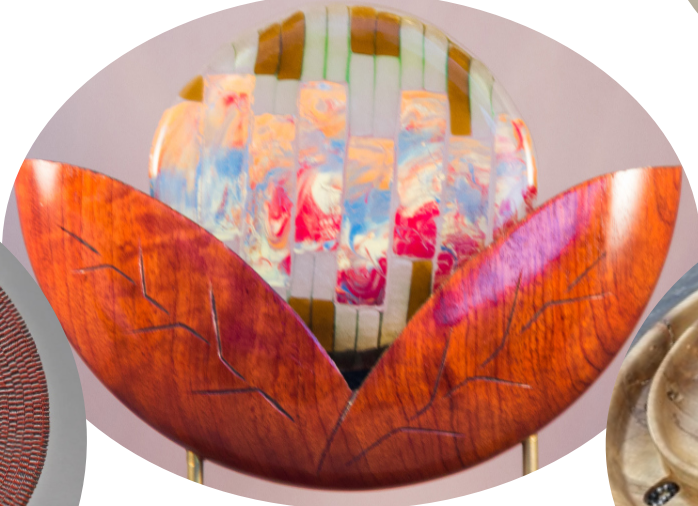
PHIL ROSE, SEPTEMBER